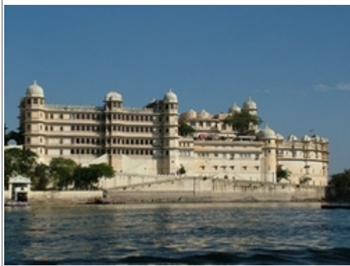
View of Fateh Prakash Palace, Udaipur