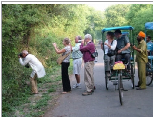
Keoladev National Park at Bharatpur