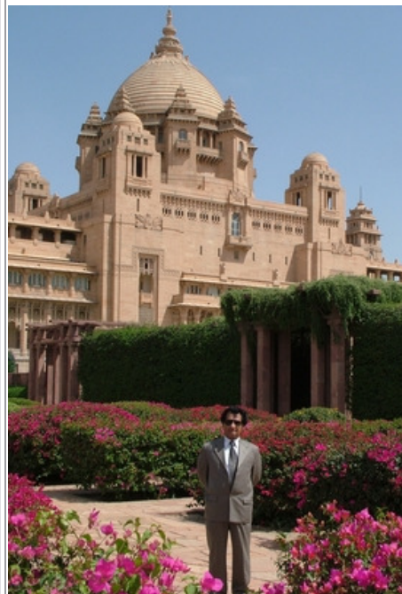
View of Ummaid Bhawan Palace, Jodhpur