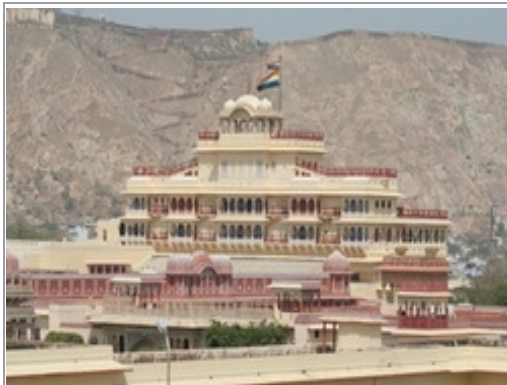
Wel Come at Pink City Jaipur