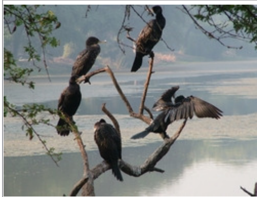
Keoladev National Park at Bharatpur