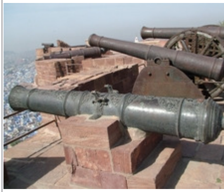
View of Mahrangarh Fort at Jodhpur