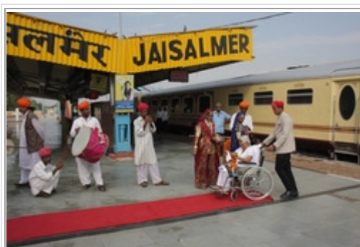
Welcome at Jaisalmer