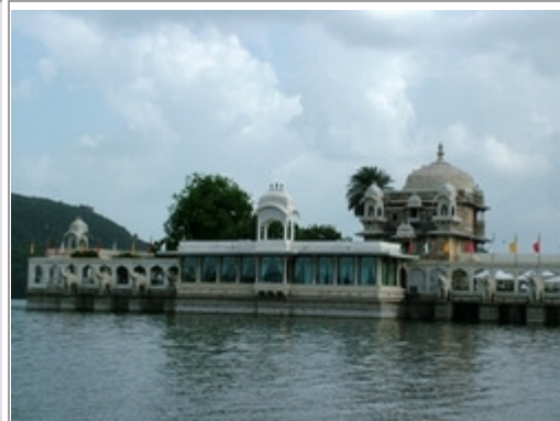
View of Jag Mandir Palace, Udaipur