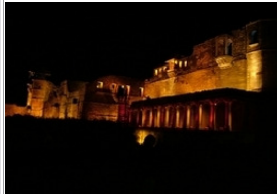
Sound & Light Show at Chittorhgarh Fort