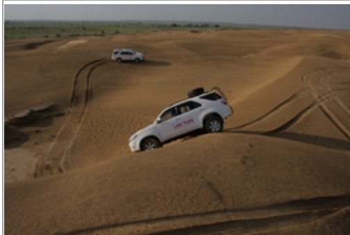
Desert Safari by Jeep at Jaisalmer