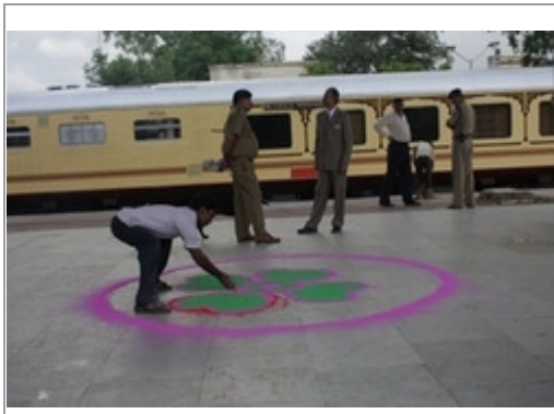
Wel Come at Pink City Jaipur