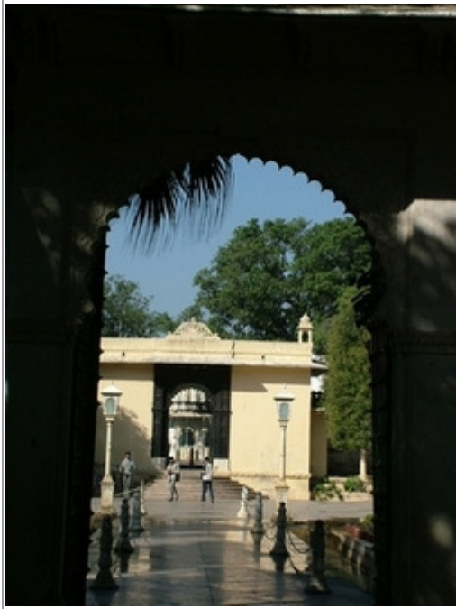
View of Sahelio ki Bari, Udaipur