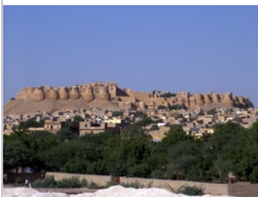
Wide View of Jaisalmer Fort