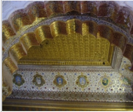
View of Mahrangarh Fort at Jodhpur