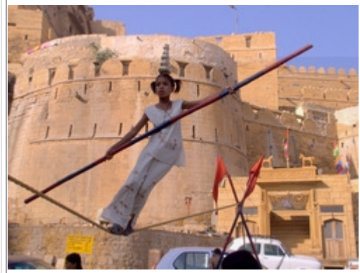
Folk dance at Jaisalmer Fort