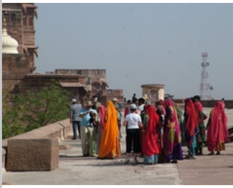
View of Mahrangarh Fort at Jodhpur