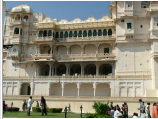
View of City Palace, Udaipur