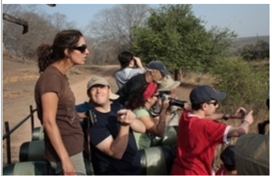
Jungle Safari at Ranthambore National Park