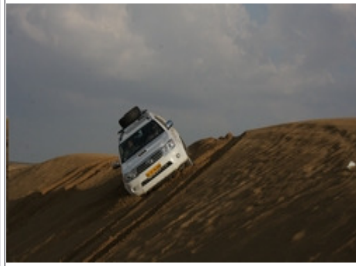
Desert Safari by Jeep at Jaisalmer