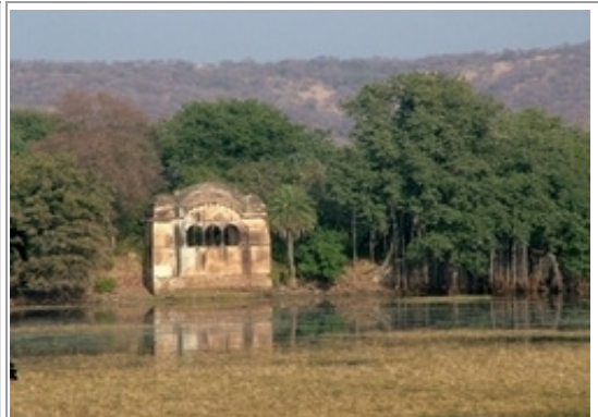
Jungle Safari at Ranthambore National Park