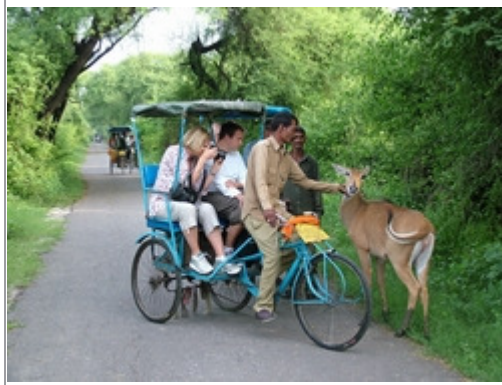
Keoladev National Park at Bharatpur