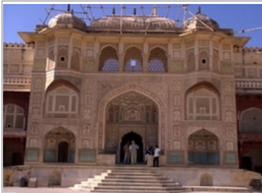
Amer Fort Jaipur