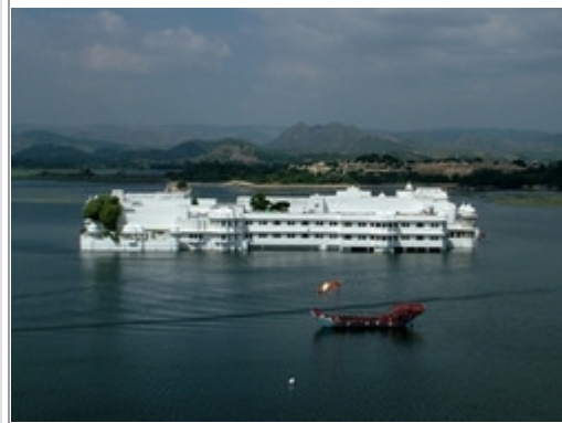
View of Lake Palace, Udaipur