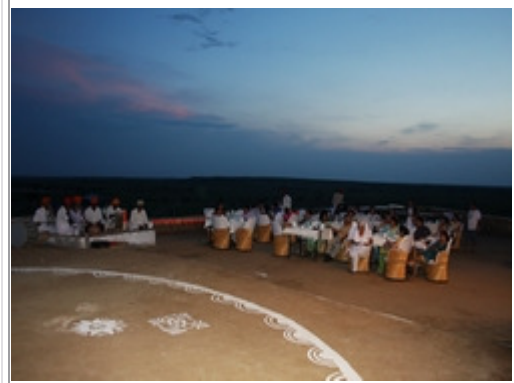
Dinner at Jaisalmer