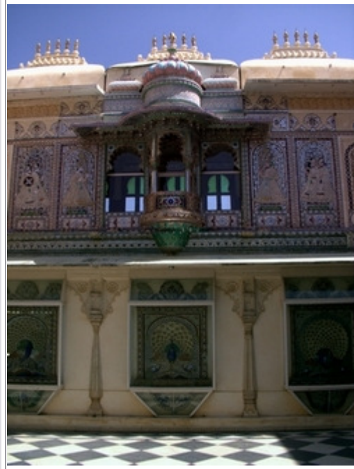
View of City Palace, Udaipur