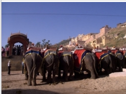
Fleet Elephant Safari at Jaipur