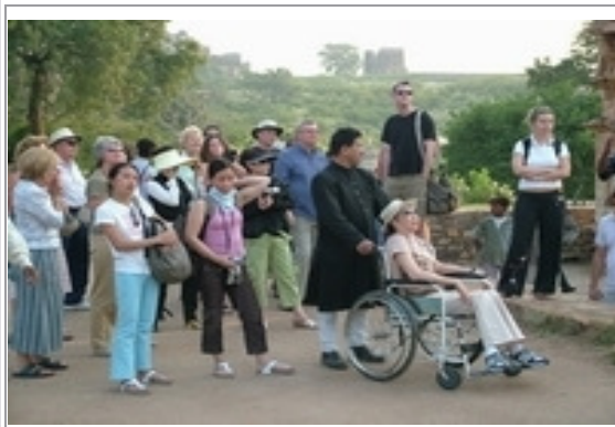
Wel come at Chittorhgarh

Palace in the fort are considered as master pieces of Rajput architecture Padmini Palace had been the residence of beautiful queen Rani Padmini.