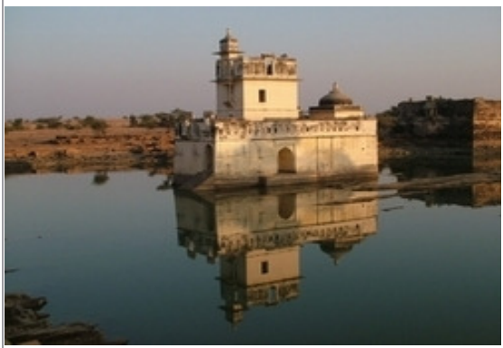
Padmini Palace, Chittorhgarh Fort