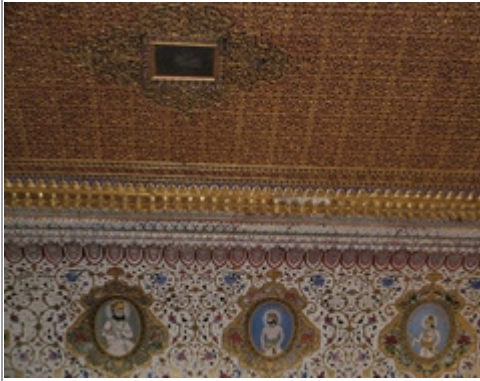
View of Mahrangarh Fort at Jodhpur