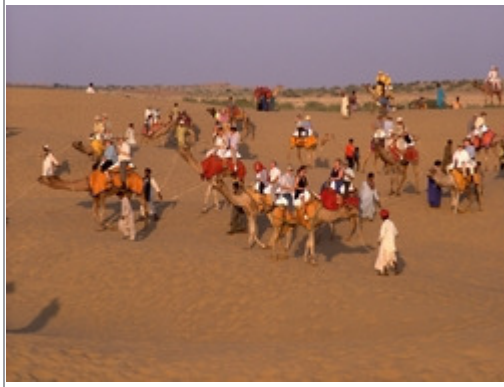
Camel Ride at Jaisalmer