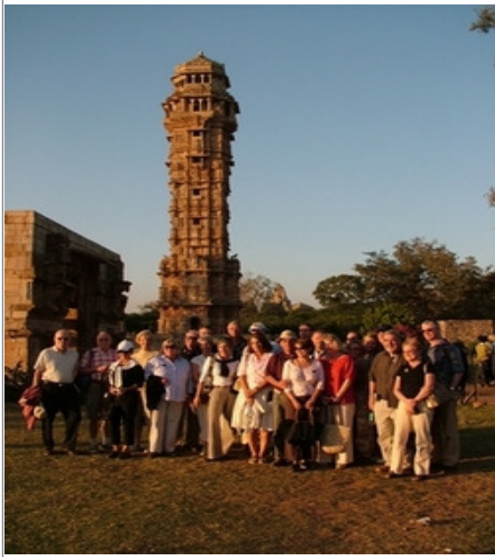
View of Victory Tower, Chittorhgarh