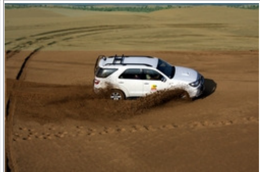
Desert Safari by Jeep at Jaisalmer