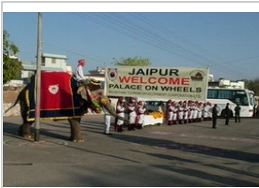
Wel Come at Pink City Jaipur