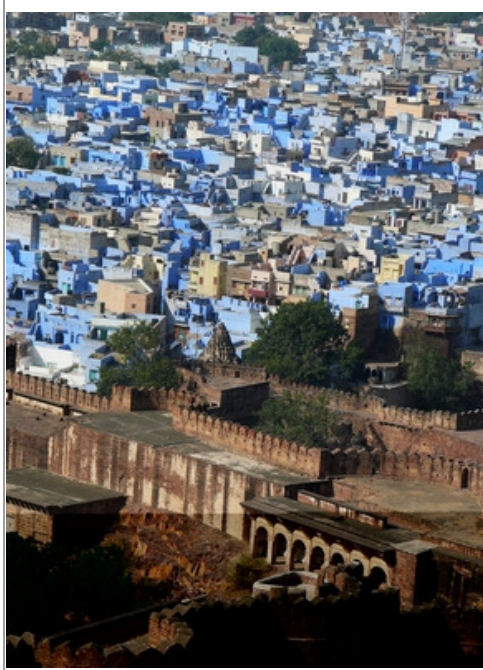
City view of Jodhpur