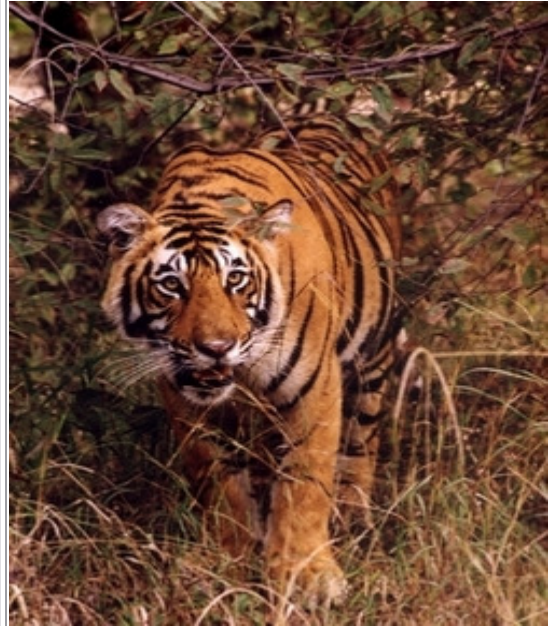
Jungle Safari at Ranthambore National Park