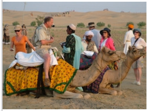
Camel Ride at Jaisalmer