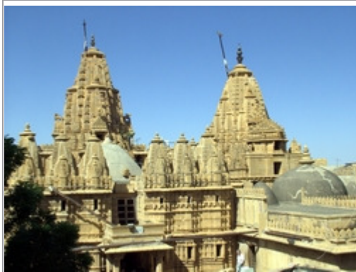
Jain Temple at Jaisalmer