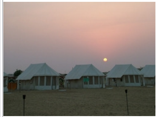
Tentage Village at Jaisalmer