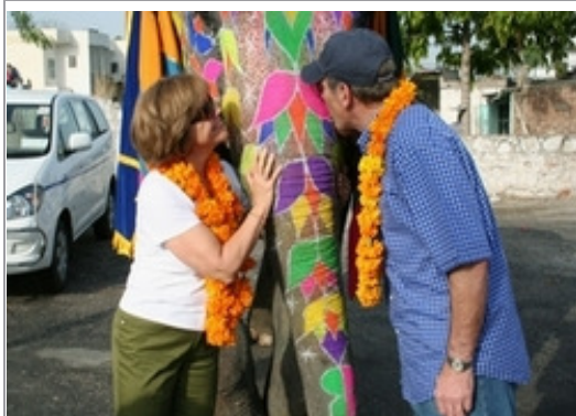
Love to Elephant at Jaipur