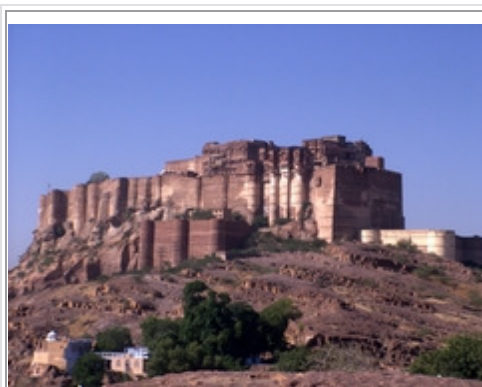
View of Mahrangarh Fort at Jodhpur

Lunch at 5 Star Hotel. After lunch back to Palace on Wheels, dinner on board.