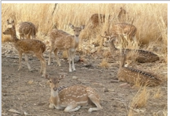
Jungle Safari at Ranthambore National Park