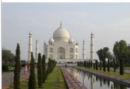
The Taj Mahal at Agra