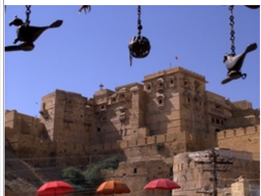
View of Jaisalmer Fort