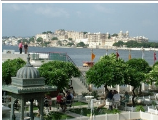
View of Jag Mandir Palace, Udaipur