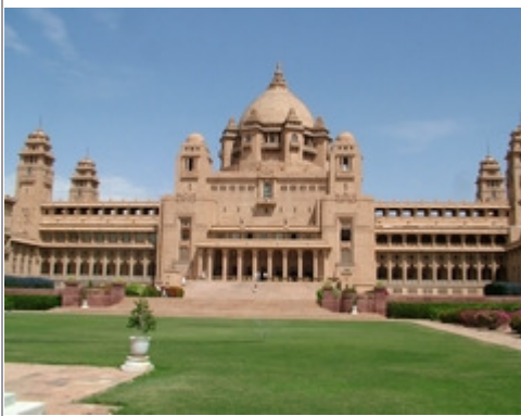
View of Umaid Bhawan Palace, Jodhpur