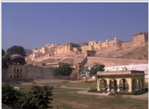
Wide view of Amer Fort Jaipur