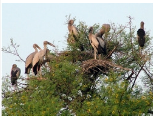
Keoladev National Park at Bharatpur