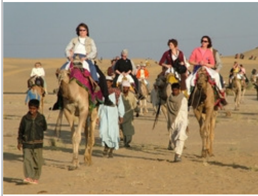
Camel Ride at Jaisalmer