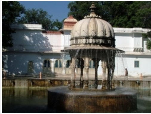
View of Sahelio ki Bari, Udaipur