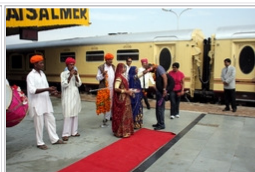
Welcome with garlanding at Jaisalmer