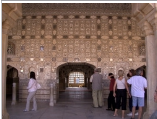
Amer Fort Jaipur