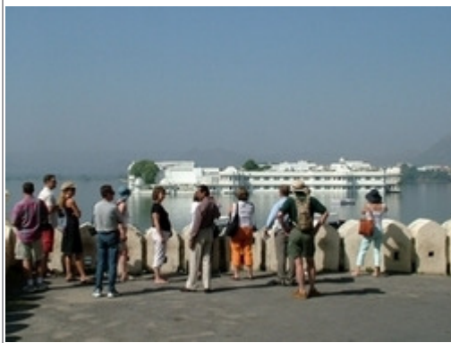
View of Lake Palace, Udaipur