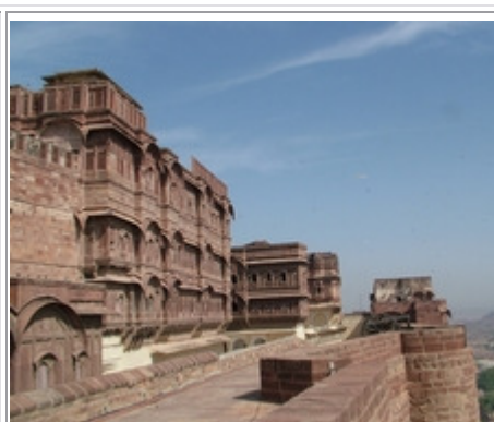
View of Mahrangarh Fort at Jodhpur