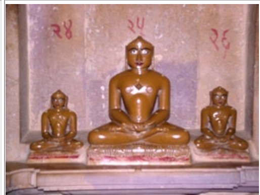
Jain Temple at Jaisalmer