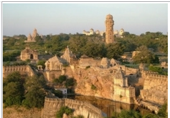
Wide view of Chittorhgarh Fort