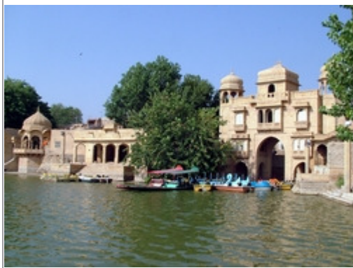
Gadisar Lake at Jaisalmer