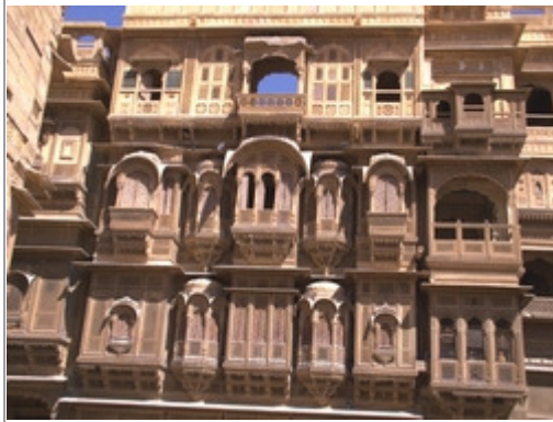
View of Havali at Jaisalmer