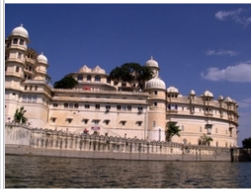
View of Fateh Prakash Palace, Udaipur