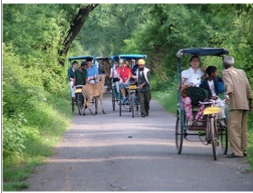
Keoladev National Park at Bharatpur