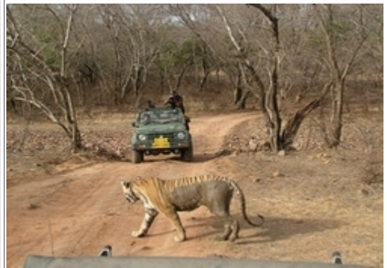
Jungle Safari at Ranthambore National Park